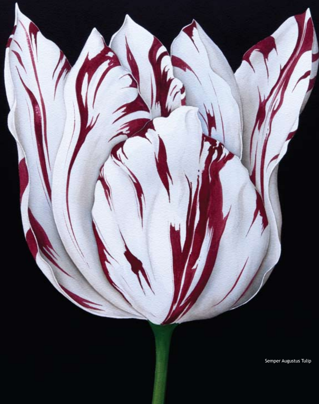
Semper Augustus Tulip