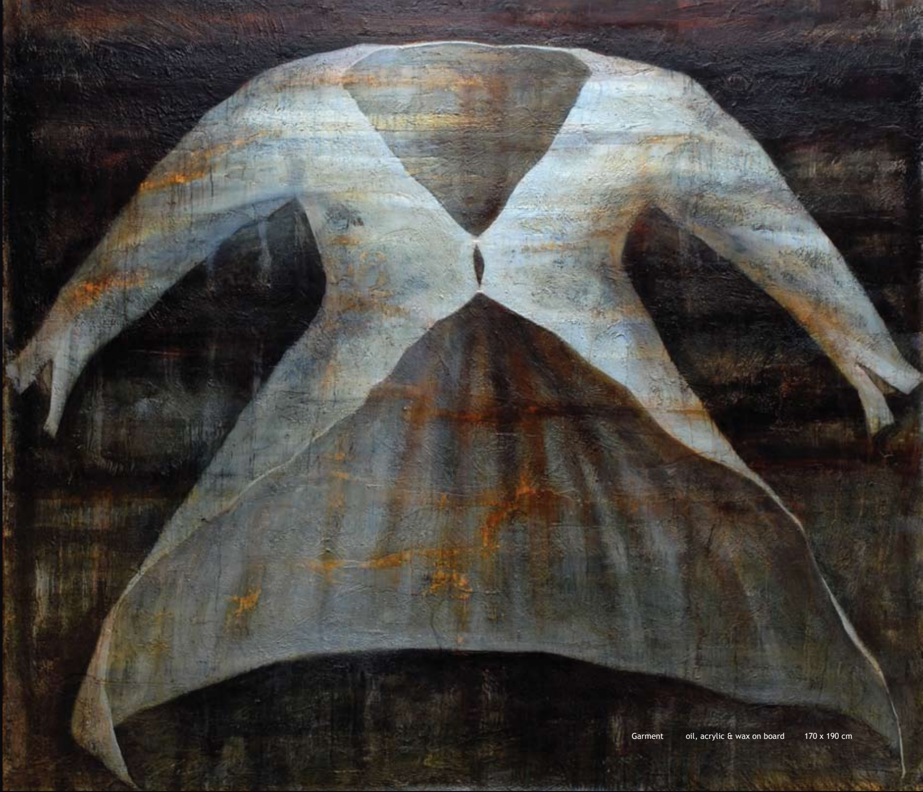
Garment oil, acrylic & wax on board 170 x 190 cm