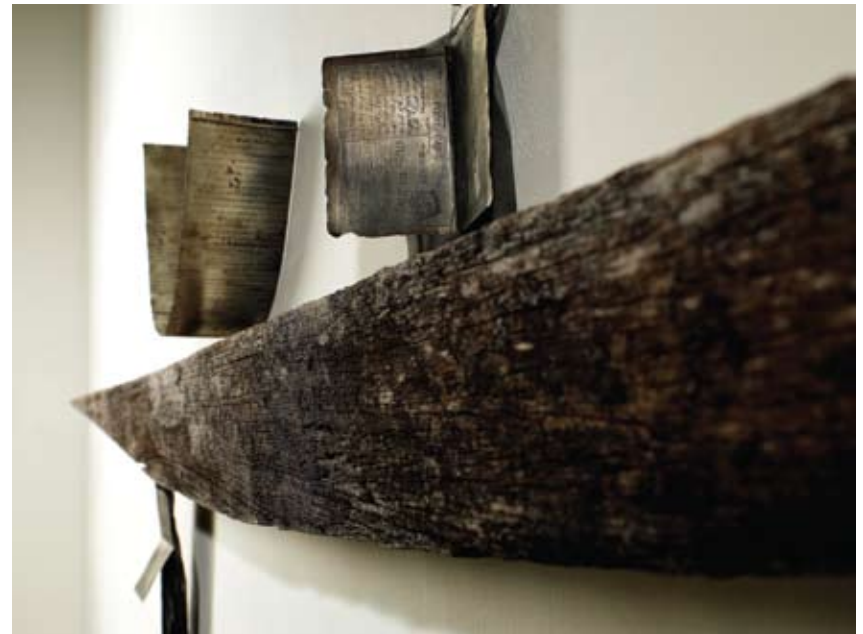
Precious Cargo (detail) etched silver, woven copper scrim, silver wire, wood 200 x 12 x 8 cm