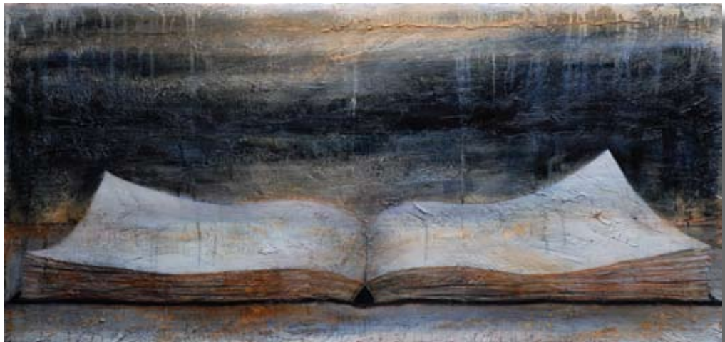
Book 2 oil, acrylic & wax on board 58 x 122 cm