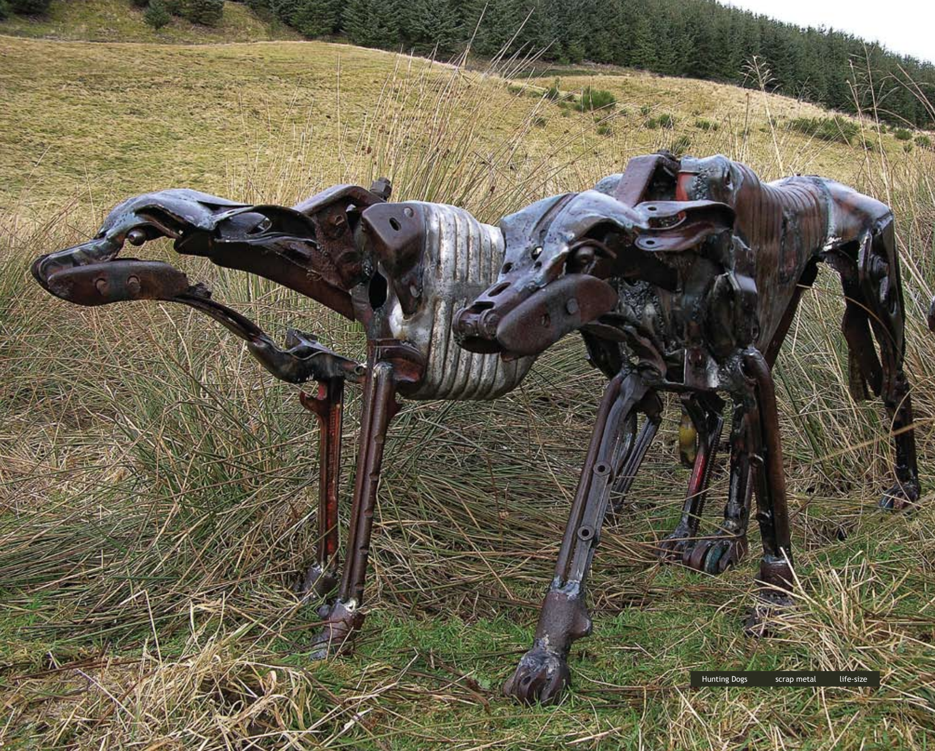
Hunting Dogs scrap metal life-size