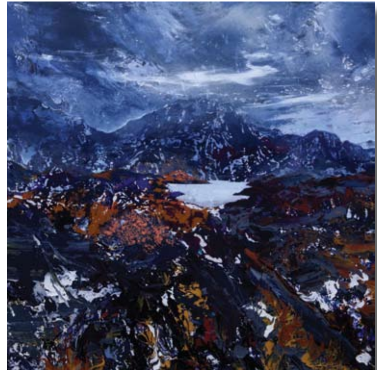
Cnoc an Odhar, Reay Forest