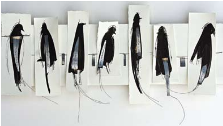
Starlings pen and ink on paper, etched silver and brass stitched detail 34 x 74 cm

It is this landscape that continues to capture and stir my imagination.