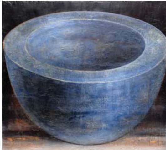
Bowl oil, acrylic & wax on board 90 x 100 cm