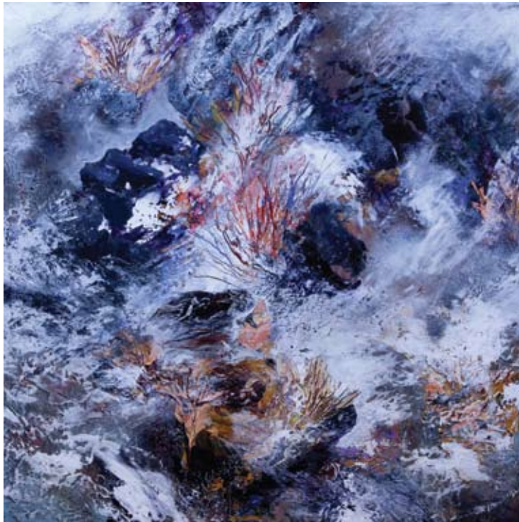
Rocks and Snow on Rhue Hill

Through this dialogue of mark making and observation I develop my perception, how I perceive the land informing my paintings and how I make the paintings informing how I perceive the land.