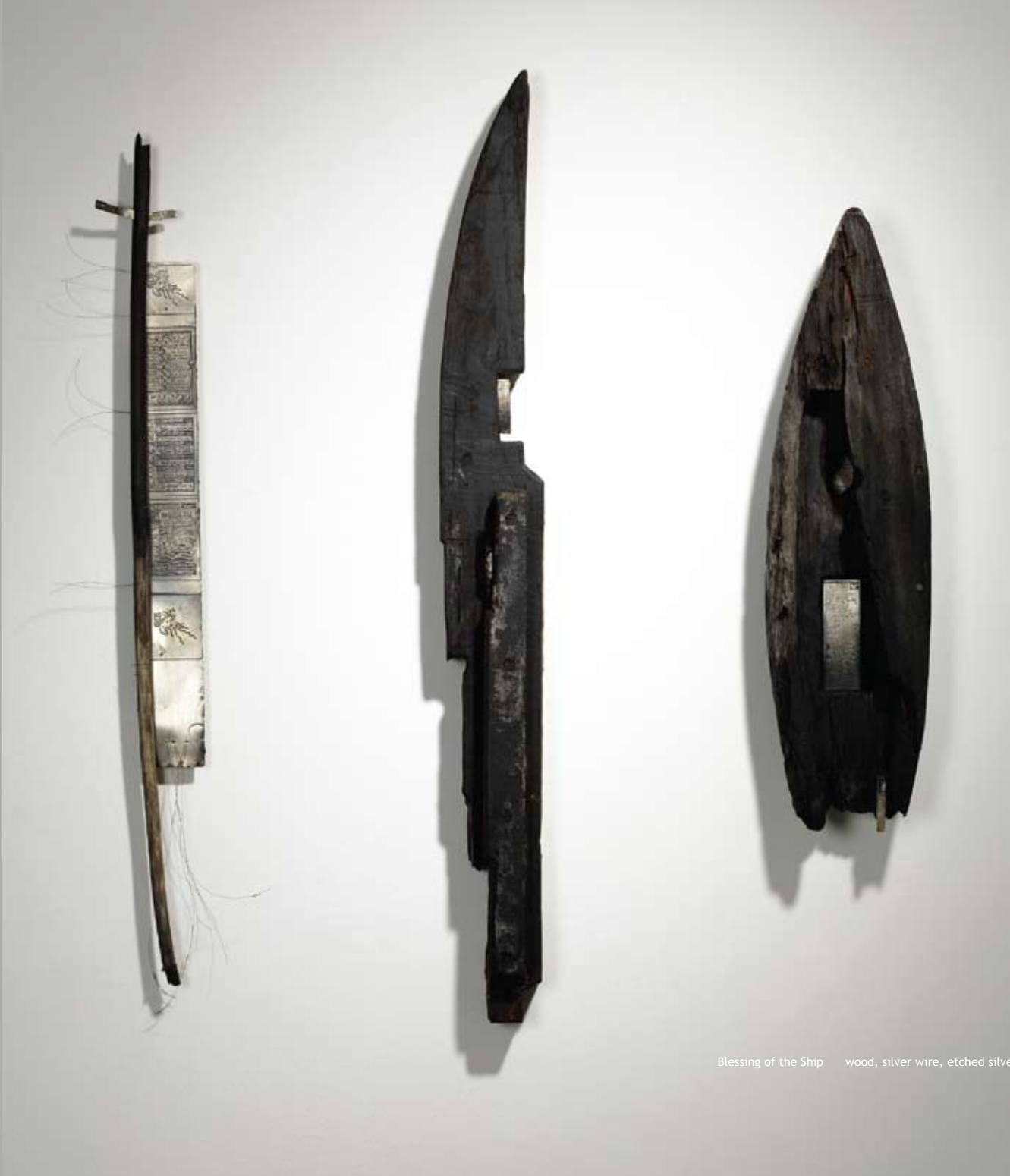
Blessing of the Ship wood, silver wire, etched silver 100 x 70 cm