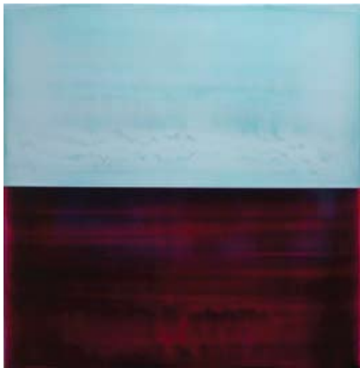
Liquid Light 20/08 acrylic on canvas 100 x 100 cm

I am fascinated in how the basic materials innate to the medium - stretcher, linen, pigment suspended in medium - can be turned into something poetic; an object filled with light, feeling and emotion. The struggle lies in attempting to reach that stage.