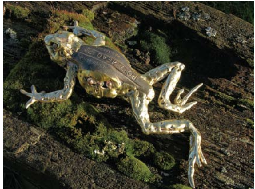
Toad scrap metal and brazing life-size