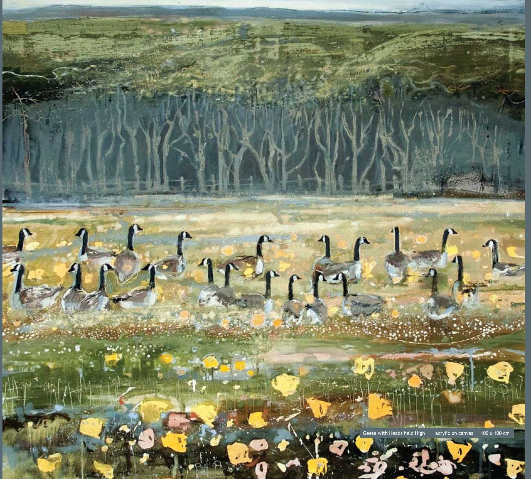
Geese with Heads held High acrylic on canvas 100 x 100 cm