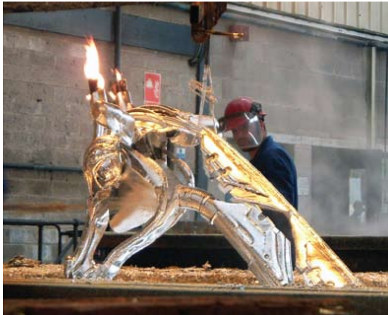
Giraffe galvanized scrap metal life-size

My two January days in Marwell Zoo could not have been richer. I came away with a true perception of giraffes and an impatience to start welding.