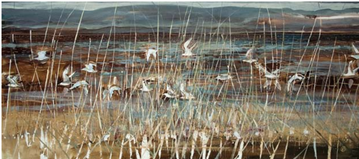
Gulls along the Far Point

The vitality and spirit of this place is what I look for and try to understand. Through my experience of its cyclical nature and by painting its trees, its patterns in the landscape and vigour of its birdlife so my perception of this place is continually evolving.